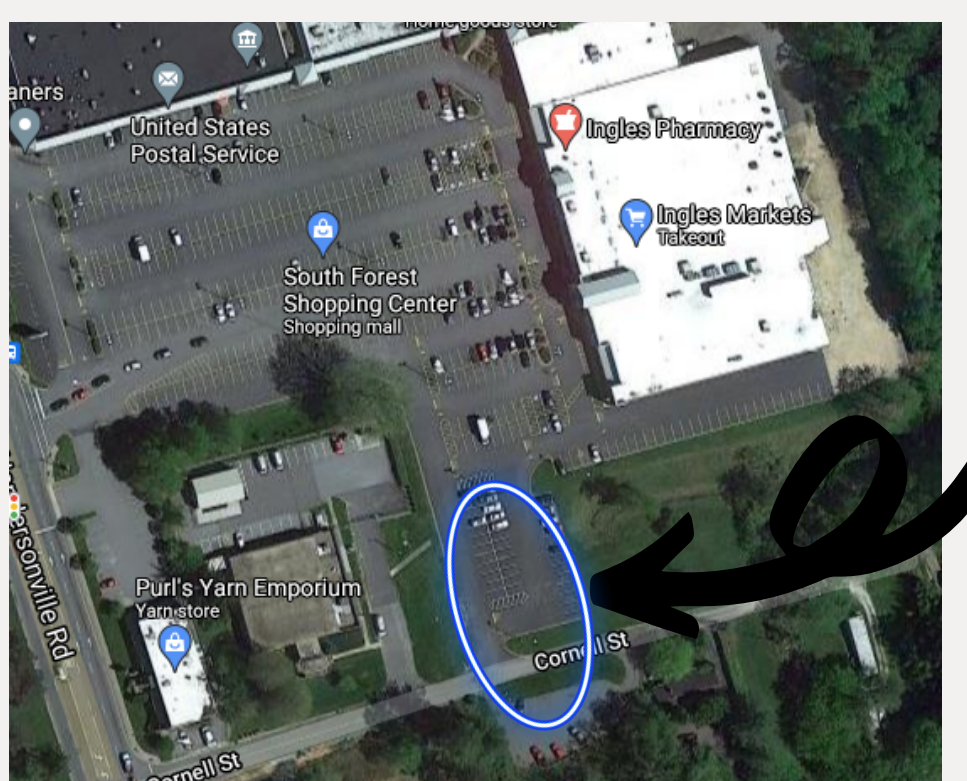
SITE 2: INGLES - BILTMORE FOREST: 780 Hendersonville Rd, AVL, 28803 7:20 AM | 3:25 PM (M-TH) | 12:25 PM (F)

Please park in the blue circled area, directly off of Cornell St, when waiting for the bus.